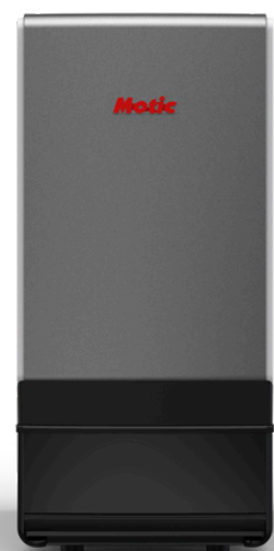
Motic EasyScan One