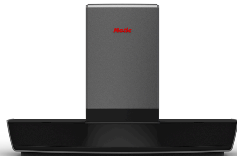
Motic EasyScan Pro