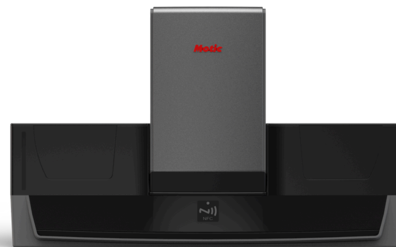
Motic EasyScan Infinity