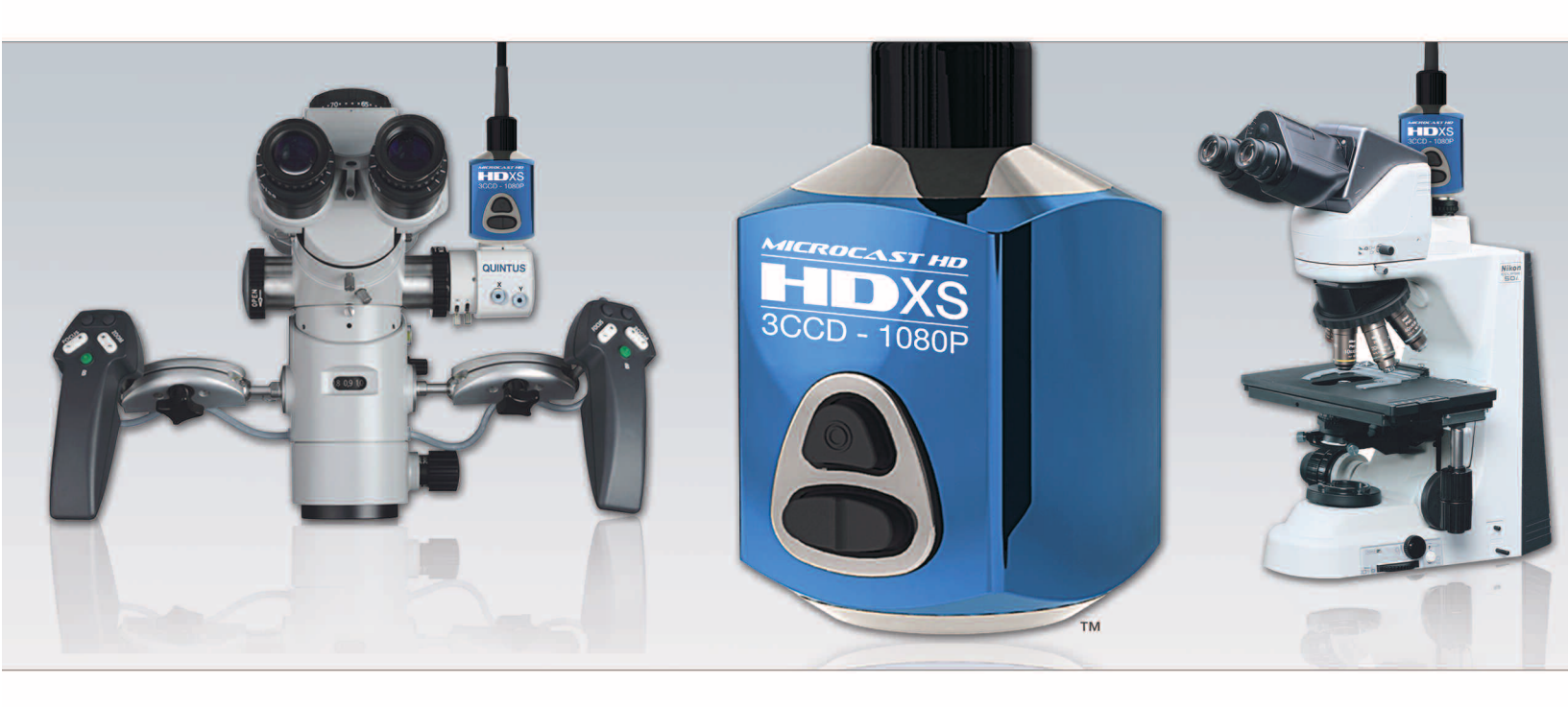
1080p • Co-Observation • Visualization • Documentation • Presentation • Publication

Optronics develops premium 3CCD high definition microscope cameras for clinical, research and industrial applications. Our Microcast HD camera platform provides the Investigator with an unparalleled real-time imaging and viewing experience that no other HD camera can deliver.