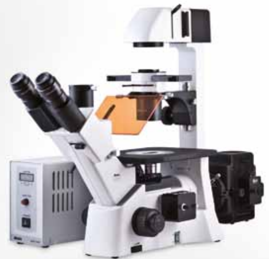
AE31 with fluorescence attachment

The illuminated field can be varied by a built-in field diaphragm ; while a filter holder may carry different glass filters for colour temperature adjustments or other imaging requirements. Together with the condenser system, perfect Koehler illumination setup can be performed.