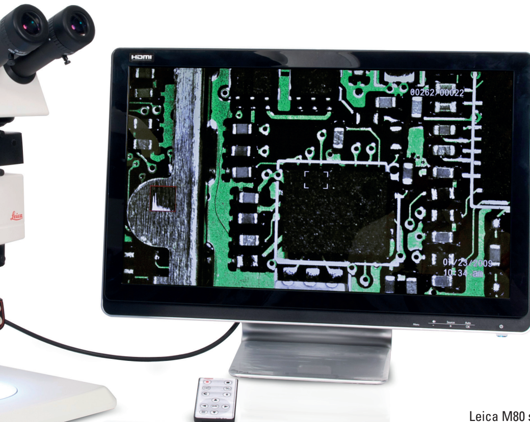
Leica M80 stereomicroscope with integrated Leica IC80 HD camera, HD RC remote control, LED3000 NVI illumination, ErgoTube, and full HD monitor.

Convenient Camera Control: The infrared (IR) remote control unit provides convenient control of camera settings including white balance, brightness, and image contrast. As needed, the user can rotate the live image 180° or pause for visual inspection using the binocular tube or monitor. At the push of a button on the remote control, movie clips can be recorded directly to an SD card for fast documentation or training purposes.