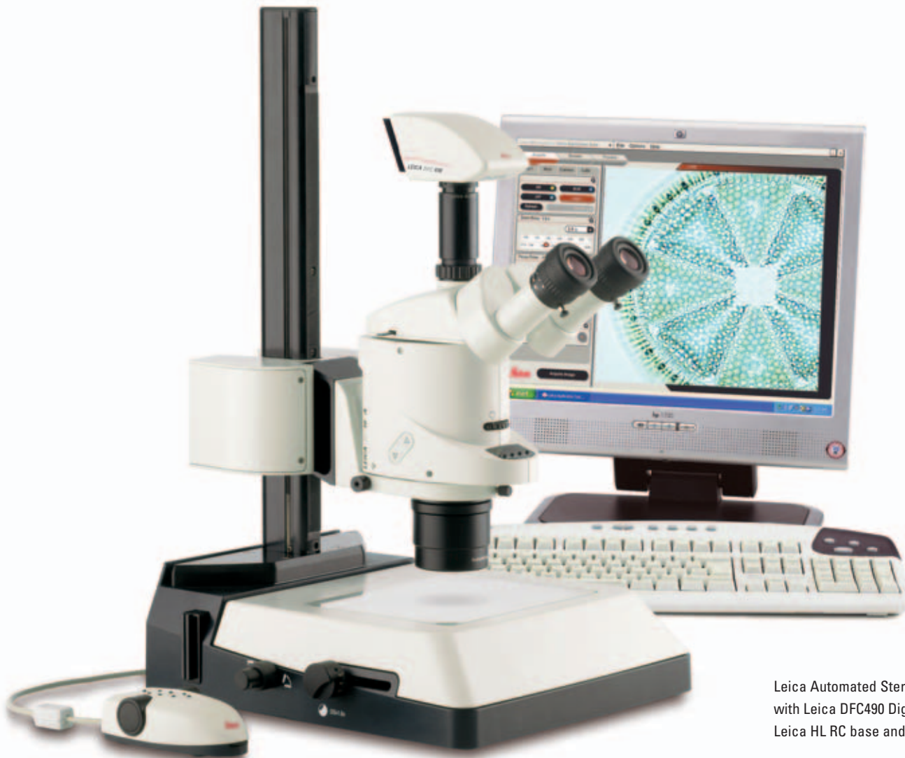
Leica Automated Stereomicroscope MZ16 A with Leica DFC490 Digital Camera, Leica HL RC base and Leica LAS Software