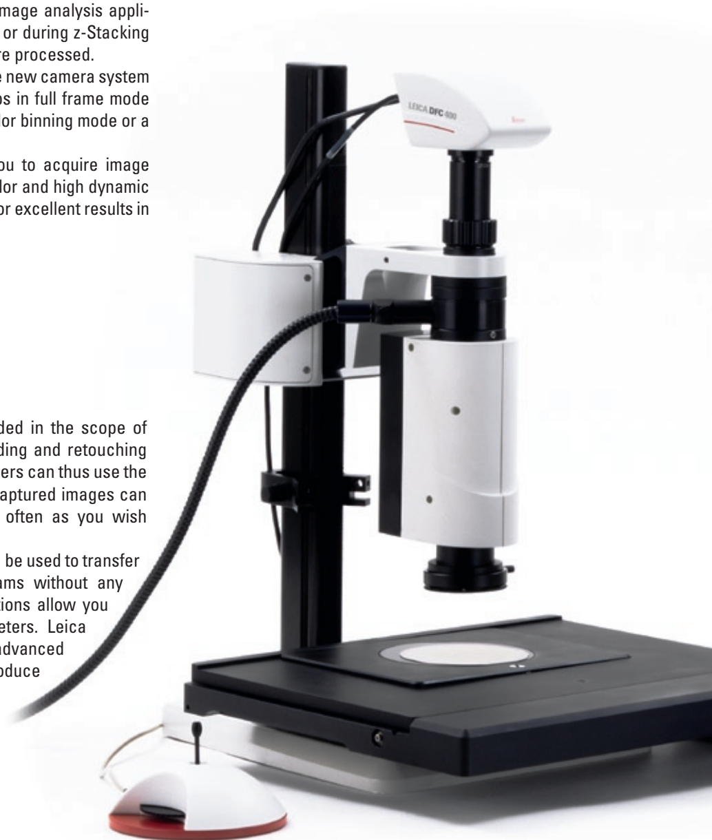
Leica Z16 APO A with motorized IsoPro™ stage and Leica DFC400

The TWAIN driver included in the delivery can be used to transfer photographs to other image editing programs without any problems. In addition, intelligent camera options allow you to conveniently set up the camera parameters. Leica cameras have automatic white balance and advanced illumination control and are thus ready to produce perfect images in seconds.