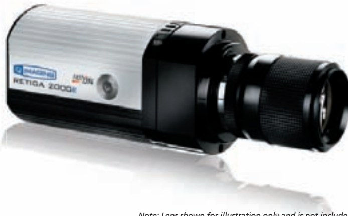
Note: Lens shown for illustration only and is not included.