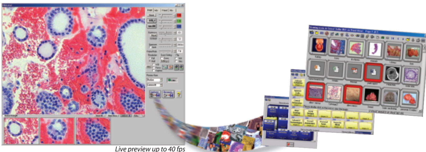
Live preview up to 40 fps