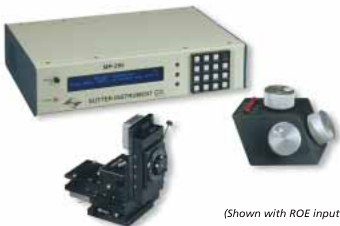
(Shown with ROE input device)

The flagship in our line of precision micromanipulators, the motorized MP-285 is affordable yet offers advanced features found in manipulators costing thousands more. Custom engineered stepping motors, precision cross-roller bearing slides and proprietary worm gear capstan drives form the basis of the watch-like mechanical system. The controller provides power to the stage motors with a quiet linear power supply to minimize electrical noise radiation in your setup. Pipette holders and headstages are securely mounted to the MP-285 with one of our several unique and rigid mounting systems.