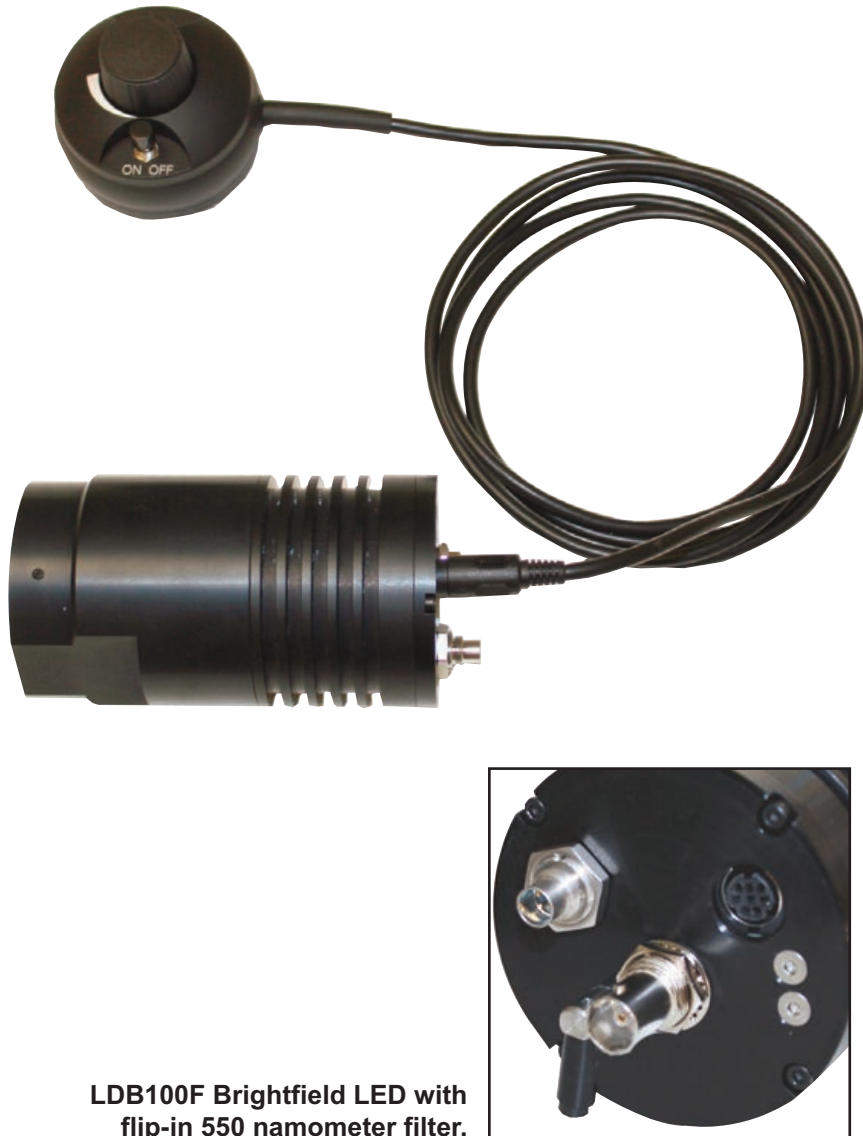
LDB100F Brightfield LED with flip-in 550 nanometer filter.

LED Illumination Systems for Brightfield Microscopy with Flip-in 550 Nanometer Filter