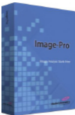
Image-Pro is inexpensive image analysis software for pathologists and researchers. CAPTURE, PROCESS, COUNT, CLASSIFY, MEASURE AND SHARE. A powerful and customizable imaging platform driven by over 35 years of user feedback, Image-Pro offers native 64-bit support, a user friendly interface and a suite of 25+ measurement solutions. Quantify pathology slide samples for percent area, intensity, size, amount and color.