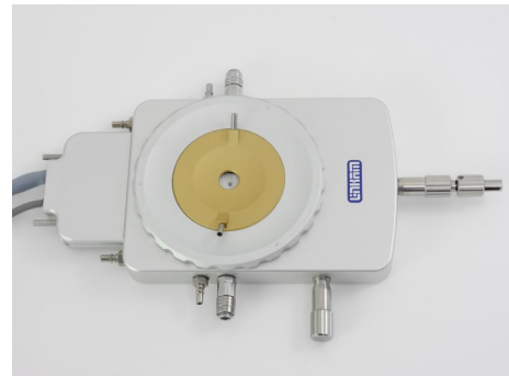
The TS1400 XY heating stage

The QICAM fast 1394 shown here is designed for high resolution brightfield scientific and industrial applications. The 1.4 megapixel CCD sensor is capable of 10fps at full resolution and 165 fps when using