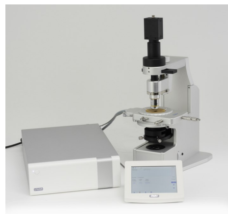
High Temperature System with T95-LinkPad controller