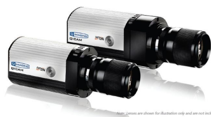
QICAM fast 1394 camera cooled and non-cooled options (shown with Nikon lenses for