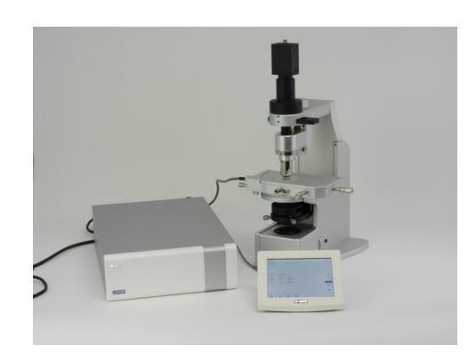
PE95-LinkPad Temperature Controller, Imaging Station and LTS120