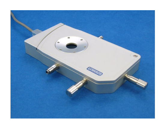
The LTS120 heating and freezing stage Temperature Range -40°C to 120°C