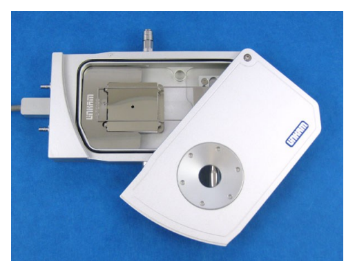
LTS120 stage showing microscope slide holder