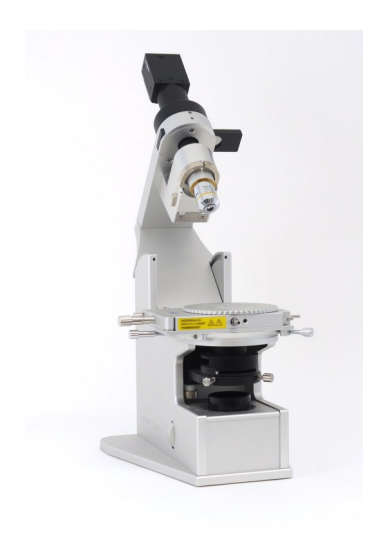
Linkam Imaging Station. Optics are tilted back to allow easy access to sample