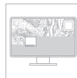
Start stitching the images