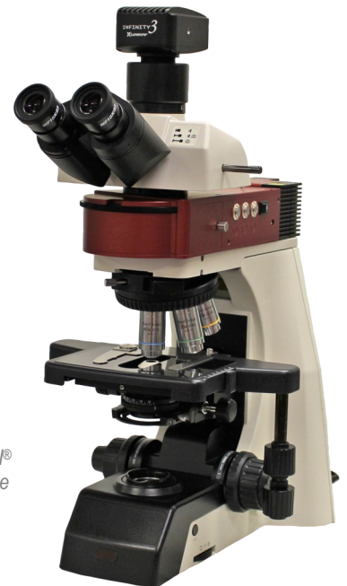
EXC-500 With FRAEN® Fluorescence Illuminator